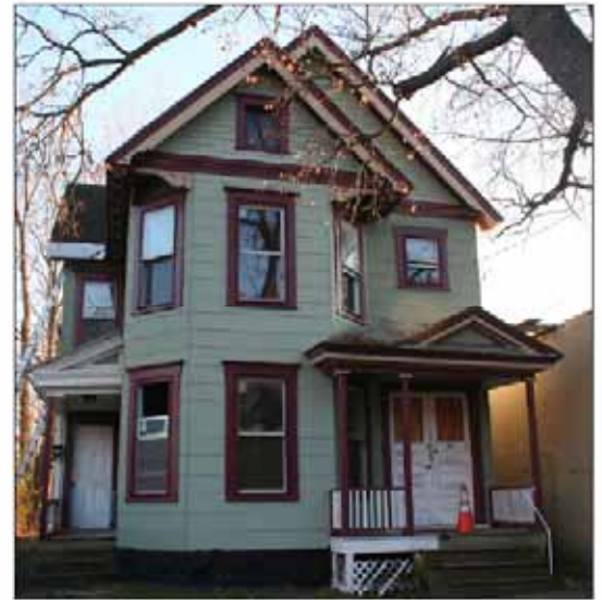
617 Marcellus Street during Jeff Beck's renovations

Get to work! No, seriously, you have 6 months to complete the immediate exterior improvements after taking title of the property and a total of 18 months to complete the full renovations of the home. Go create your own space!