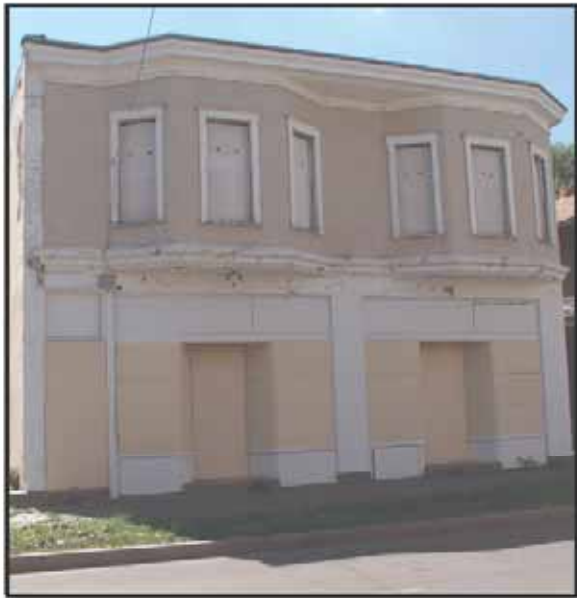
412 Oswego Street - $1

Ideal for a workshop, gallery space, ice cream parlor, photography studio, cafe, or small restaurant. Built in 1900, this Victorian era, 1,462 square foot brick structure has a vast upstairs residential unit with 2 bedrooms, 1 bath, big kitchen, formal dining room, and living room. First floor unit has endless possibilities with open floor plan and incredible display windows. The structure sits on a 37'x52' lot, and could potentially be sold with two adjacent vacant lots.