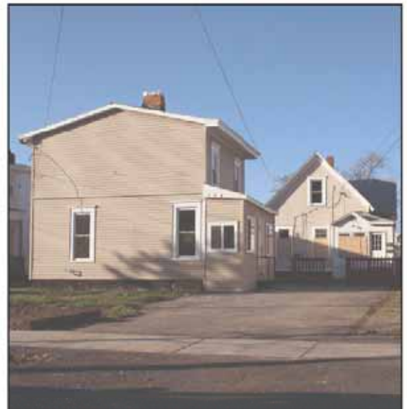
506 Otisco Street - $2