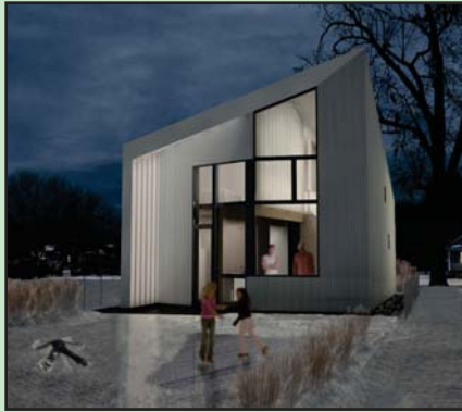
619 Otisco St. - $80,000 "R-House" Design by the Architectural Research Office & Della Valle Bernheimer. One of a kind green home. Winning design from international design competition.