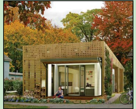
317 Marcellus St. - $80,000 "Live.Work.Home" Design by Cook + Fox. One of a kind green home. Winning design from international design competition.