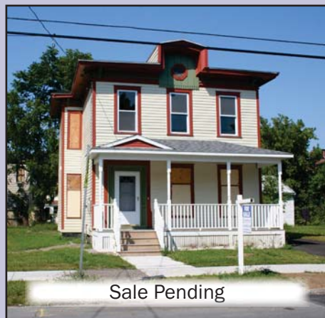
1304 W. Onondaga St.. - $64,000* 3 bdrm, 1.5 bath, 2 driveway, formal dining room, bamboo floors in kitchen. Many original details; stained glass, fireplace & woodwork throughout.