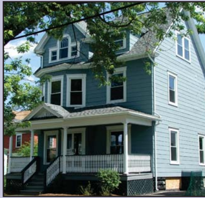
403 W. Beard Ave. - $63,900* 4 bdrm, 1 bath, 2 car garage, finished 3rd floor, built-in pantry, formal dining room & large side yard. Close to Kirk Park.