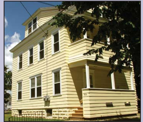
920 Park Ave. - $83,500* 2-family, 2 bdrms, 1 bath in each, close to Frazer Park & Sacred Heart Basilica. ($159,900 with no income eligibility subsidy)